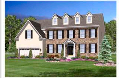
SHOWN WITH OPTIONAL FULL HEIGHT STONE